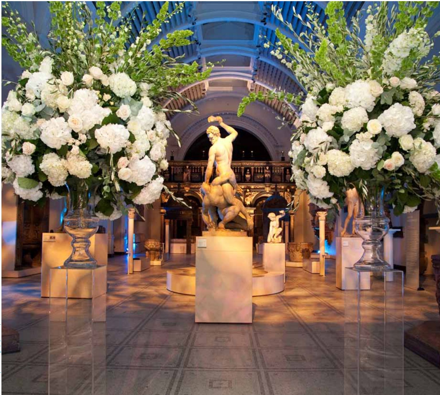
Pinstripes and Peonies